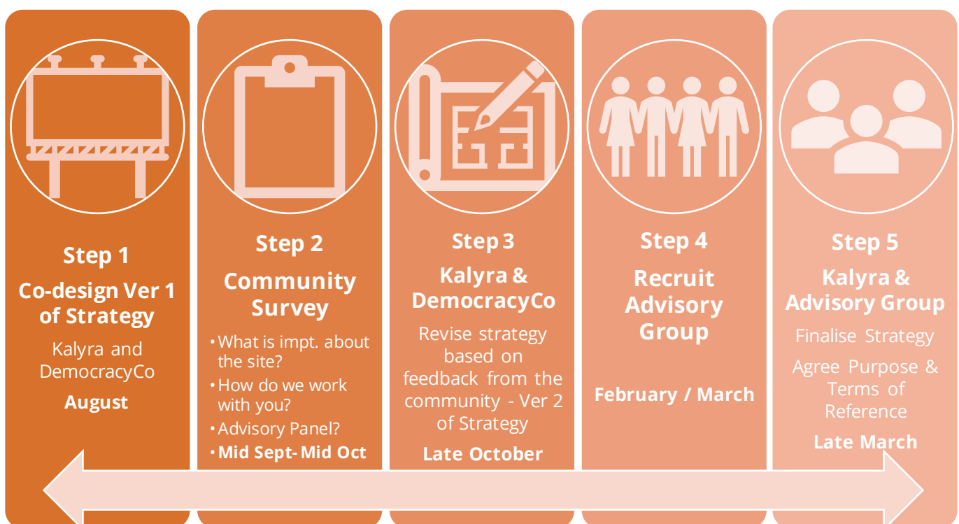
Figure 1 – Phase 1 At a glance

This Phase starts in August 2023 and will be completed by late March (or April) 2024. The Steps in this Phase are summarised in Figure 1.